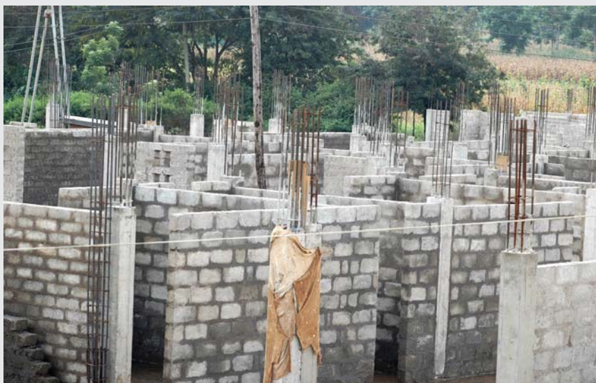
Construction of the Stiefel Ward is moving along rapidly!